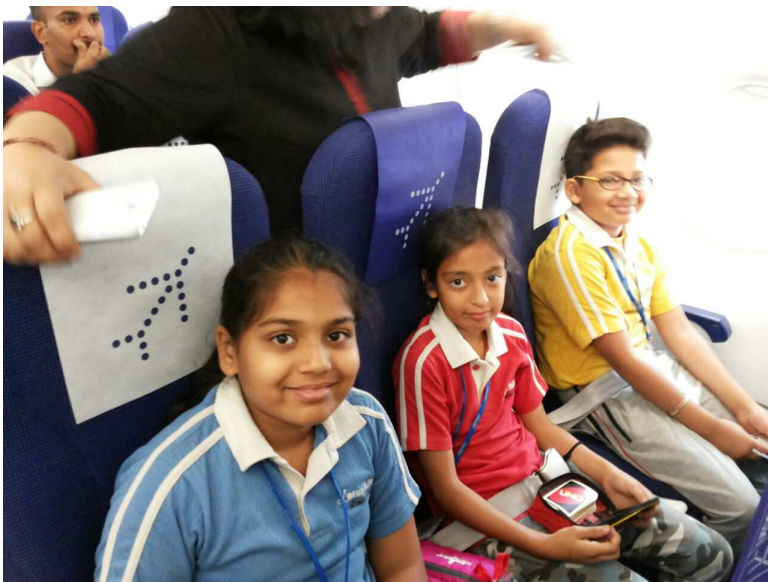
Children at new delhi T3 terminal