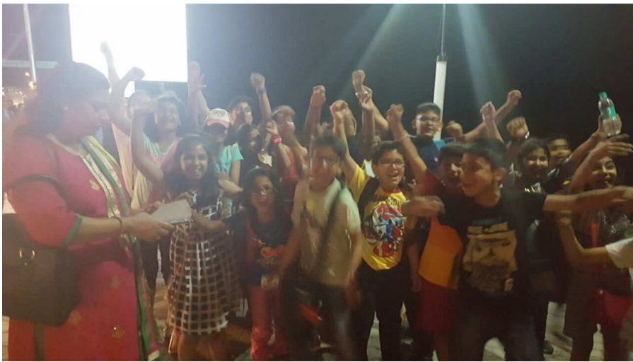
Children enjoying at fish aquarium .