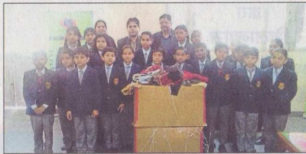
■ (Clockwise from above, far left) Students and staff of Lilawati Vidya Mandir Sr Sec School, Shakti Nagar, after collecting woollens for the needy; Students of Lotus Valley International School, Noida, pose with their contributions; Boxes full of warmth being sent from Bharatiya Vidya Bhavan's Mehta Vidyalaya, KG Marg; Delhi Public School, Greater Noida, students with warm clothes donated by them; Similar scenes at Rukmini Devi Public School, Pitampura and JP International School, Greater Noida